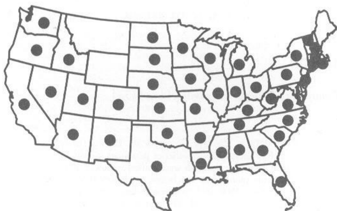
Fig. 1. Distribution of Eurasian watermilfoil in the United States.